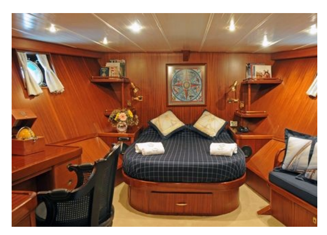
Master cabin "Saint-Malo"