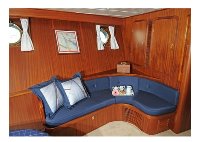
Master cabin "Saint Malo" seating