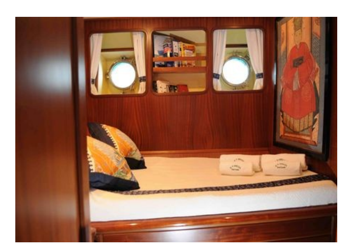
Double cabin "Shanghai"