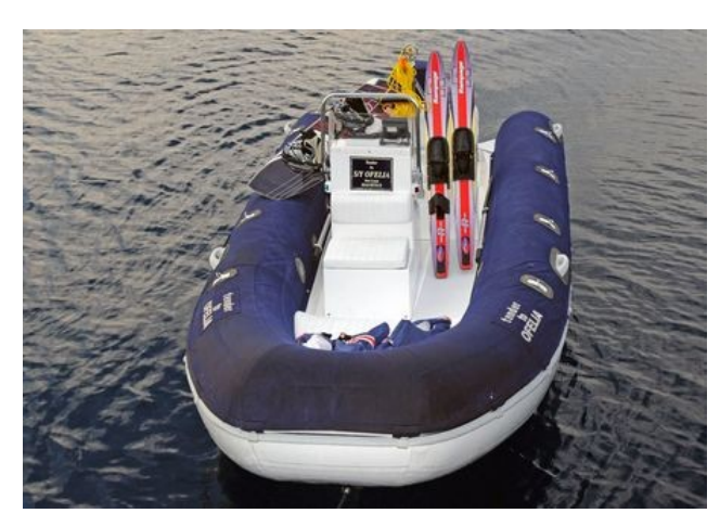
Tender and toys