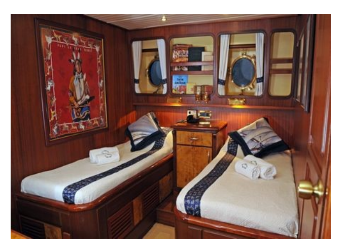
Twin cabin "Newport"