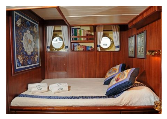
Double cabin "Istanbul"