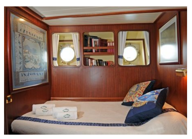
Double cabin "St. Petersburg"