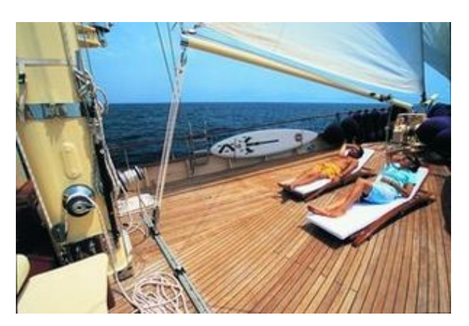
Sun lounge on deck