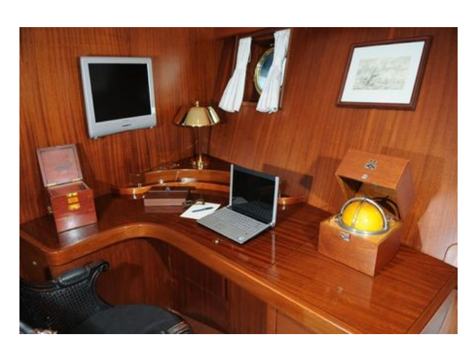
Master cabin "Saint Malo" equipment