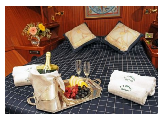
Master cabin "Saint-Malo" 1