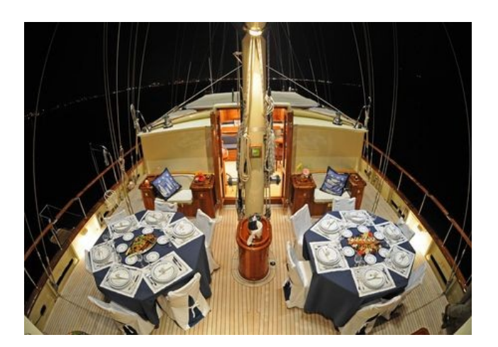
Dining on deck