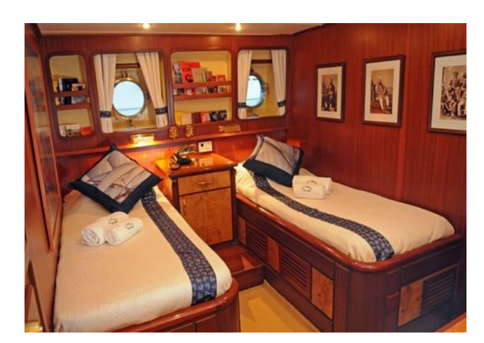
Twin cabin "Pondichery"