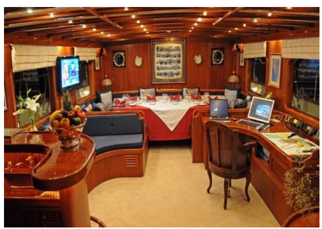
Salon and dining area