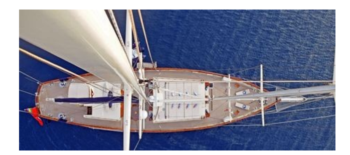
birds eye view